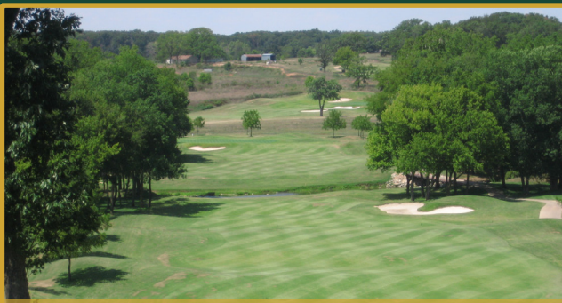
Great Color Contrast

I hope that everyone had a safe and enjoyable summer and I look forward to seeing you on the golf course. If you have any questions or comments about what is happening on the golf course, please stop me on the course or contact me.