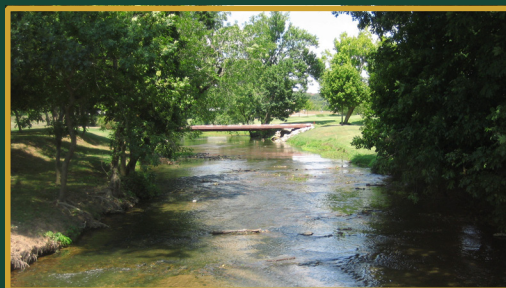
The Beautiful Osage Creek