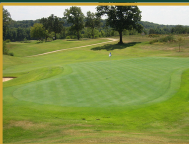
#13 Green Looking Good