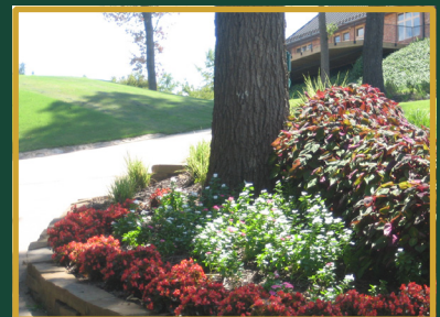
A Great View At The Turn